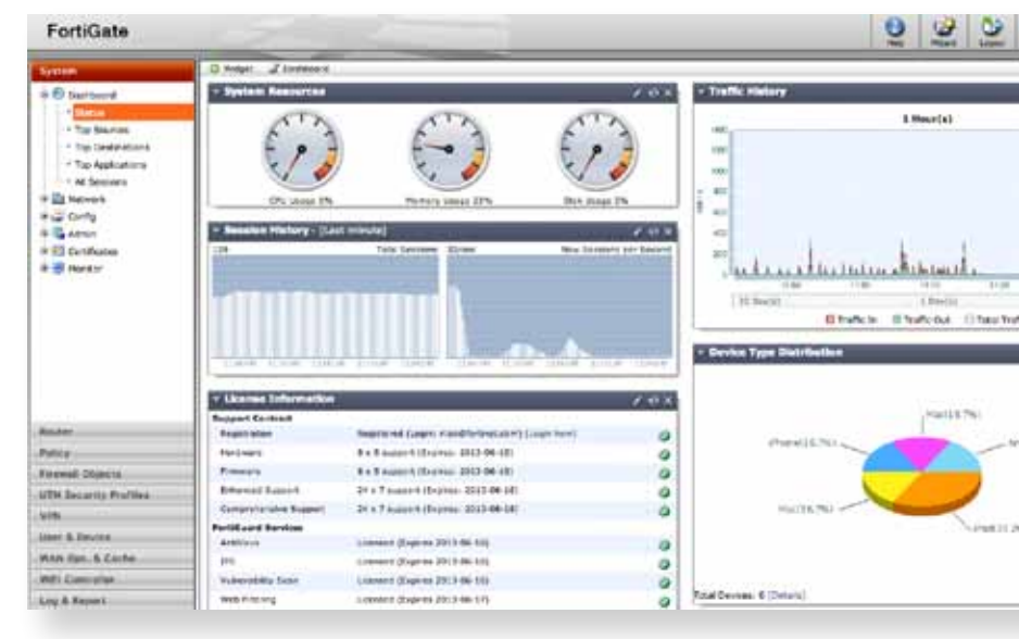
FortiOS Dashboard — Single Pane of Glass Management

Fortinet FortiGuard Subscription Services provide automated, real-time, up-to-date protection against the latest security threats. Our threat research labs are located worldwide, providing 24x7 updates when you most need it.