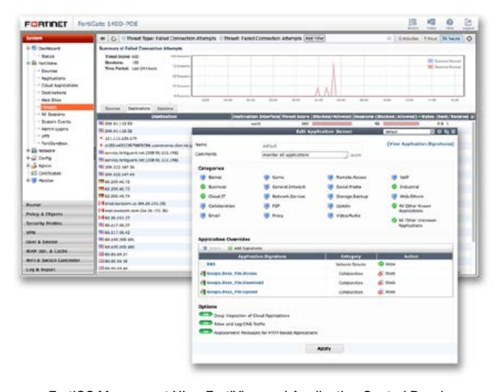
FortiOS Managment UI — FortiView and Application Control Panel